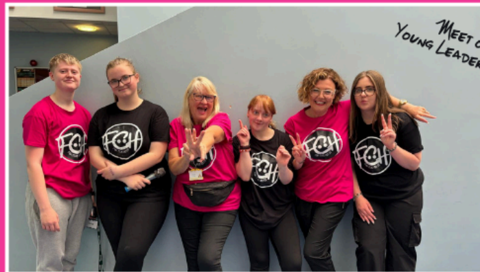
MEET OUR AWESOME YOUNG LEADERS AND VOLUNTEERS

The Young leaders are a real asset to the Charity we would not be able to provide such a variety of activities to young people if they didn't take up these roles. They provide an important bridge between our Youth Workers who deliver the session.